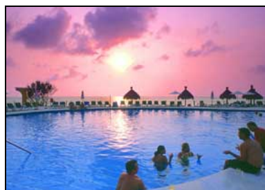
Occidental Grand Cozumel