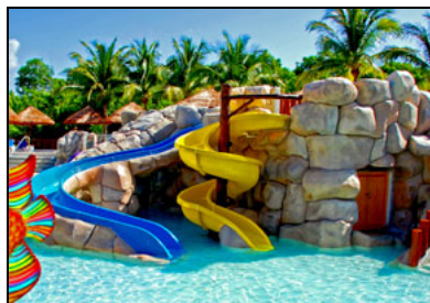
Sandos Caracol Resort